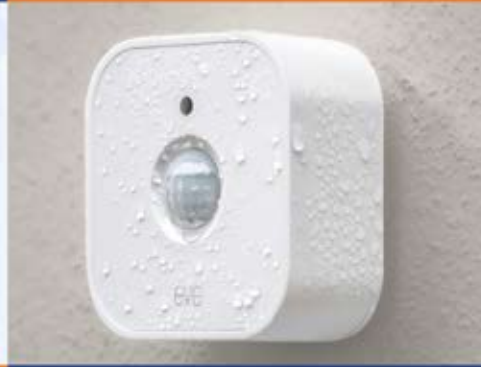
SMART MOTION SENSOR