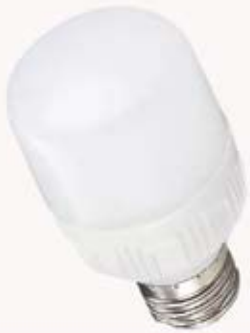
SMART LIGHT SWITCH