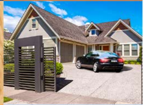
SMART GARAGE DOOR