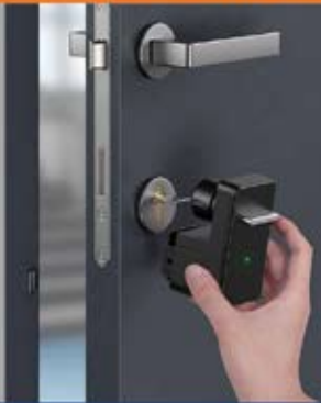
SMART DOOR LOCK