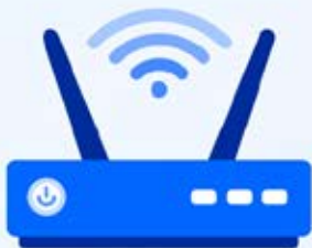
SMART MESH WIFI